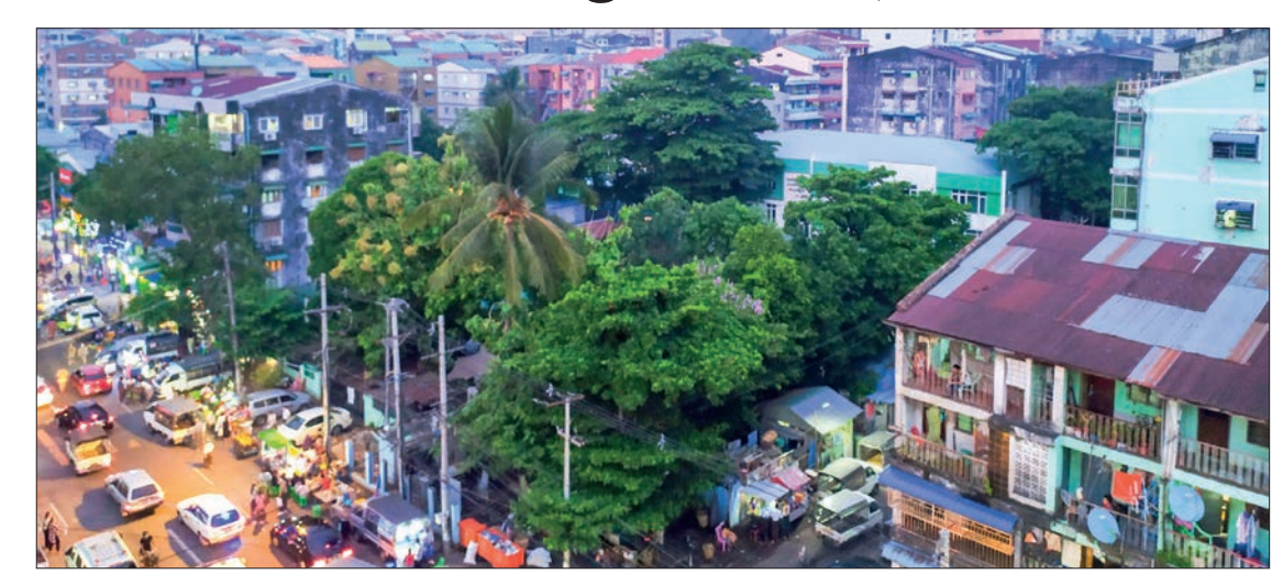
The market for rental property is in good condition and the transactions have been slack in Yangon, according to real estate agencies.

Most of the people prioritize the apartments depending on