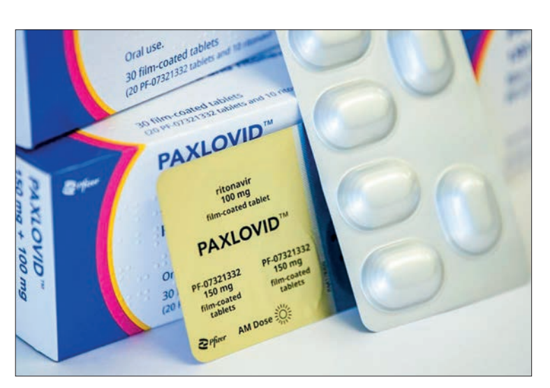
Paxlovid is now widely available at community pharmacies in the United States.

Paxlovid is also expected to be effective against the Omicron variant, Farley said. The FDA authorized Paxlovid in December 2021 for the treatment of mild-to-moderate COVID-19 in adults and pediatric patients 12 years of age and older weighing at least 40 kilogrammes, with positive results of direct SARS-CoV-2 viral testing who are also at high risk for progression to severe COVID-19, including hospitalization or death. Although the number of COVID-19 hospitalizations has decreased dramatically since early 2022, some high-risk patients are still getting sick enough to require hospital admission.