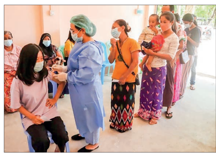
A local in Myintkyina Township, Kachin State seen receiving a COVID vaccine.

On 5 May, doctors and nurses from public hospitals, medical teams from the Tatmadaw, relevant healthcare workers in collaboration with volunteers gave COVID-19 vaccines to 2,050 people from twelve townships in Kachin State, 4,774 people from thirteen townships in Shan