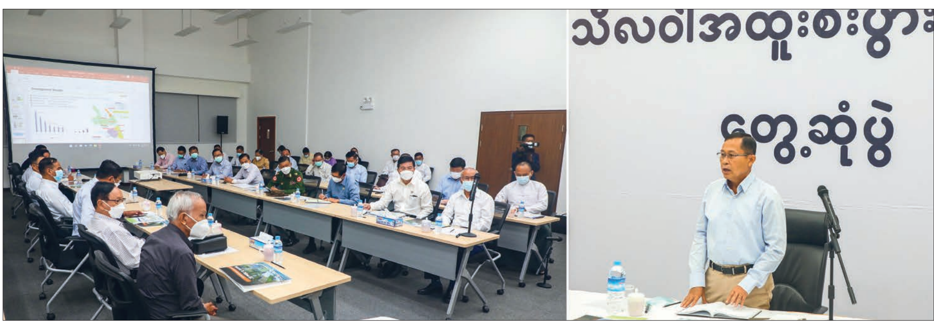
State Administration Council Vice-Chair Deputy Commander-in-Chief of Defence Services Vice-Senior General Soe Win meets the Thilawa Special Economic Zone Management Committee officials in Thanlyin Township on 6 May 2022.

UPON completion of projects in phases, SEZ will create more than 300,000 jobs, up from 13,300 at present, said State Administration Council Vice-Chair Deputy Commander-in-Chief of Defence Services Commander-in-Chief (Army) Vice-Senior General Soe Win while meeting officials from the Thilawa Special Economic Zone Management Committee yesterday afternoon.