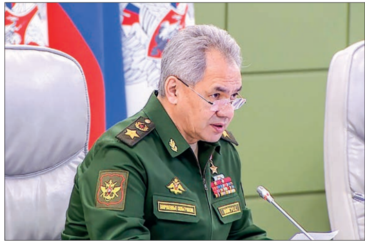
Russian Defence Minister Sergei Shoigu holds a meeting with top defence officials on 4 May 2022.

ANY vehicle of the North Atlantic Treaty Organization (NATO)