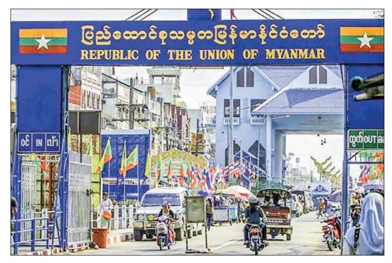
The Myawady-Mae Sot Friendship Bridge (1).

Travellers will need to make a border pass and passport to pass through the bridge and will be allowed in line with the COVID-19 health regulations.