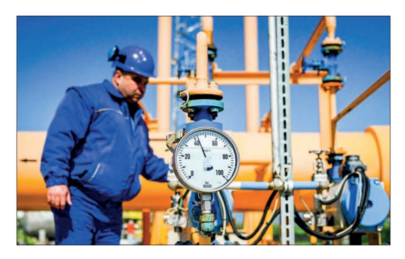
Bulgaria, which was cut off by Russia last week, has received more than 90 per cent of its gas supplies from Russia for decades.

THE halt of Russian gas supplies to Bulgaria last week has left companies big and small scrambling as they fear halts in deliveries and rising prices.