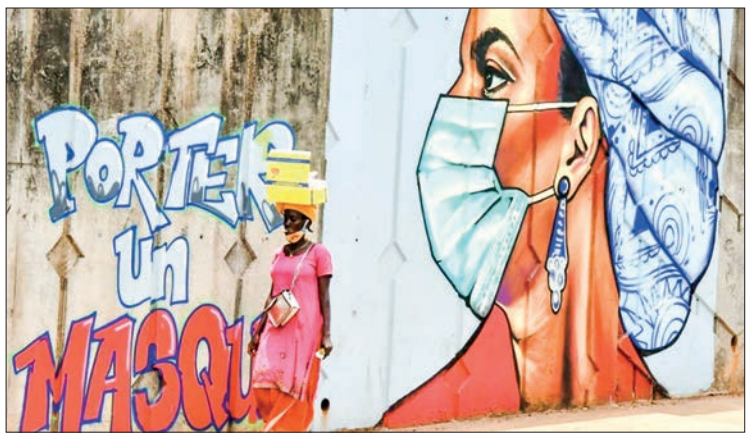
With a total number of laboratory-confirmed cases of nearly 3.8 million and more than 100,000 deaths, Covid-19 has hit South Africa harder than any other country on the continent. PHOTO: AFP

The WHO has officially recorded more than 6.2 million Covid deaths worldwide since the start of the pandemic, but the true toll is believed to be far higher.—AFP