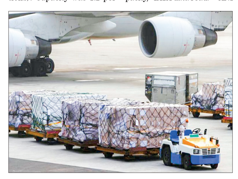
The effects of Omicron in Asia, the Russia-Ukraine war and a challenging operating backdrop contributed to the decline.

cent above March 2021 (+2.6 per cent for international operations). While this is in positive territory, it is a significant decline from the 11.2 per cent year-on-year increase in February. Asia and Europe experienced the largest falls in capacity," IATA data read.— ANI