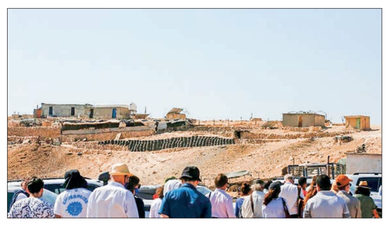
European Union officials and Israeli rights group representatives visit Palestinian communities in the Masafer Yatta area, in October 2020.

The roughly 1,000 Palestinians living there said it was their people's home long before Israe-