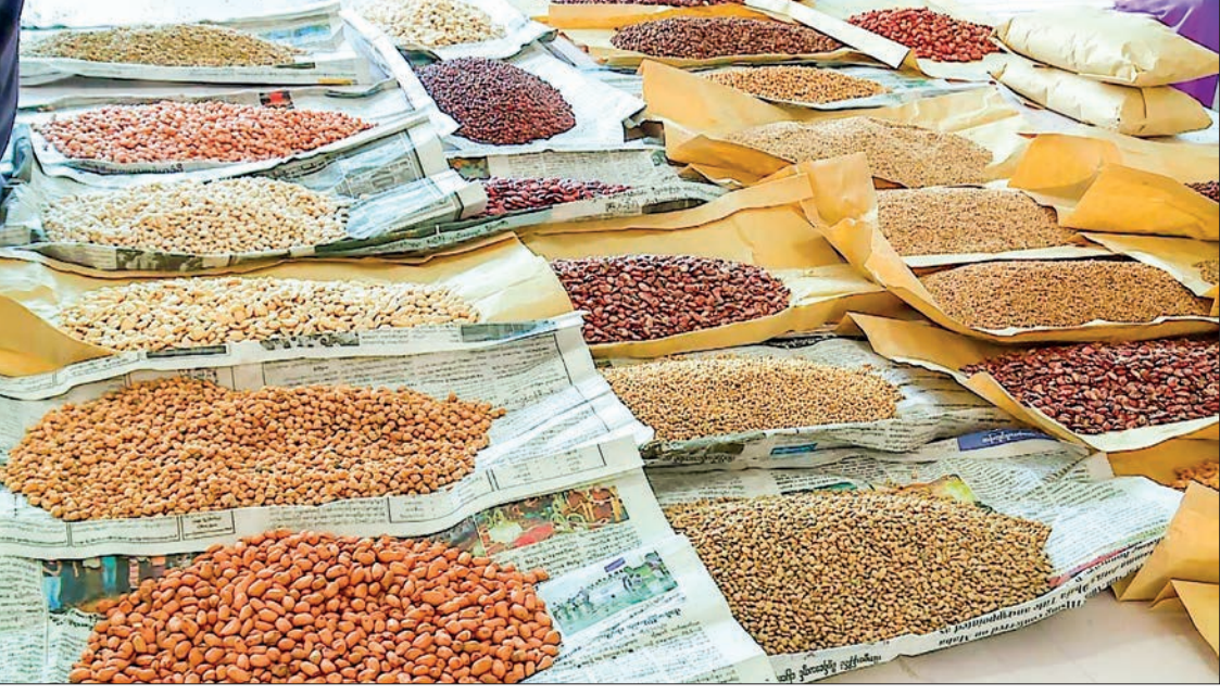
Myanmar conveyed US$830.625 million worth of over 1.09 million tonnes of various beans and pulses to foreign trade partners between 1 October 2021 and 31 March 2022 in the mini-budget period.

lowing Kyat weakening against the US dollar. A US dollar exchange rate is now around K2,000 in the unofficial exchange source. The price of black beans (Fair