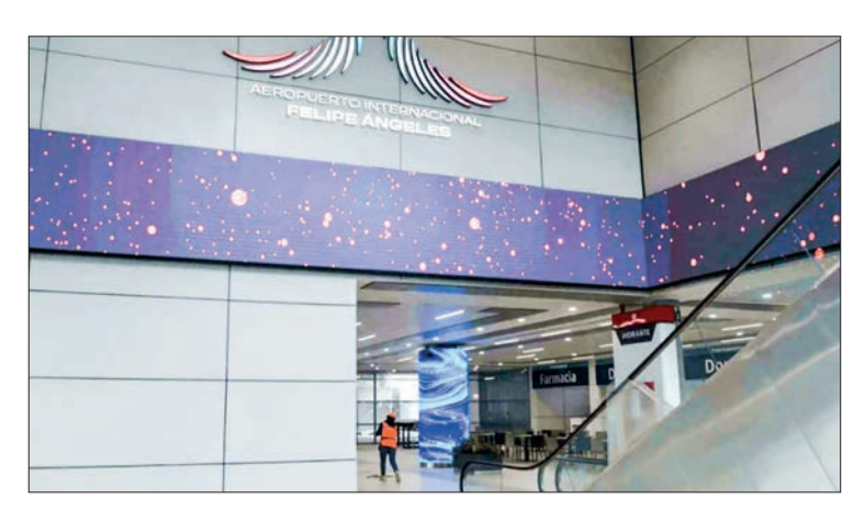
Felipe Angeles International Airport, located north of Mexico City, is one of President Andres Manuel Lopez Obrador's flagship projects.

THE opening of a second international airport for Mexico City has resulted in safety incidents