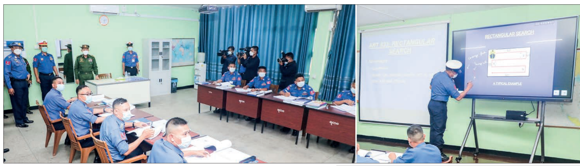
The Vice-Senior General inspects the Naval Dockyard Command Headquarters in Thanlyin Station yesterday.

VICE-CHAIRMAN of the State Administration Council Deputy Commander-in-Chief of Defence Services Commander-in-Chief (Army) Vice-Senior General Soe Win inspected the Naval Dockyard Command Headquarters in Thanlyin Station yesterday afternoon.