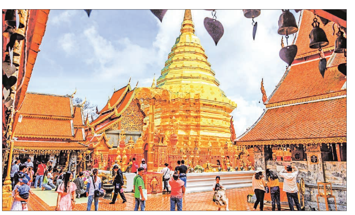
Visitors take pictures of the gold-plated stupa at Wat Phra That Doi Suthep Buddhist temple in Chiang Mai, Thailand in November 2020.

Inventive efforts were made to help tourism weather two years of COVID, including "travel bubbles," "vaccine passports" and "resilient corridors".