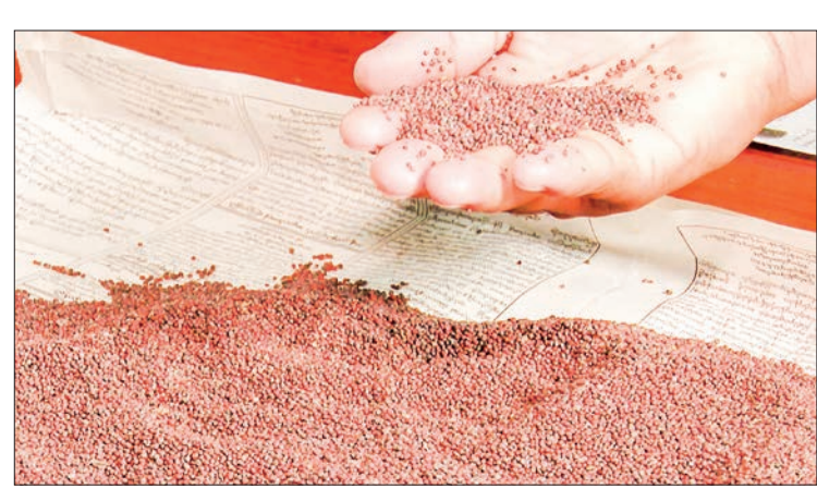
Those oil crops are commonly found in hill regions - southern and northern Shan State and Kachin State and upper Sagaing Region. Those seeds are delivered to the other regions and states through the Mandalay

"That oil crops fetch higher prices this year. There are two types of mustard family of flowering plants (Brassicaceae) containing oil seeds and vegetables. Canola crops can be cultivated only once a year. They are grown in November and harvested in January. The seeds are commercially