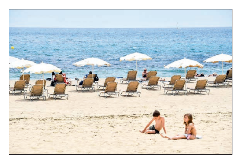
Arrivals from Britain — Spain's largest market — stood at 1.8 million, nearly 30 times the figure in 2021. PHOTO: AFP

In its decision late on Wednesday the High Court said the villagers "failed to prove" their claim to permanent residence before its declaration as a training zone.—AFP