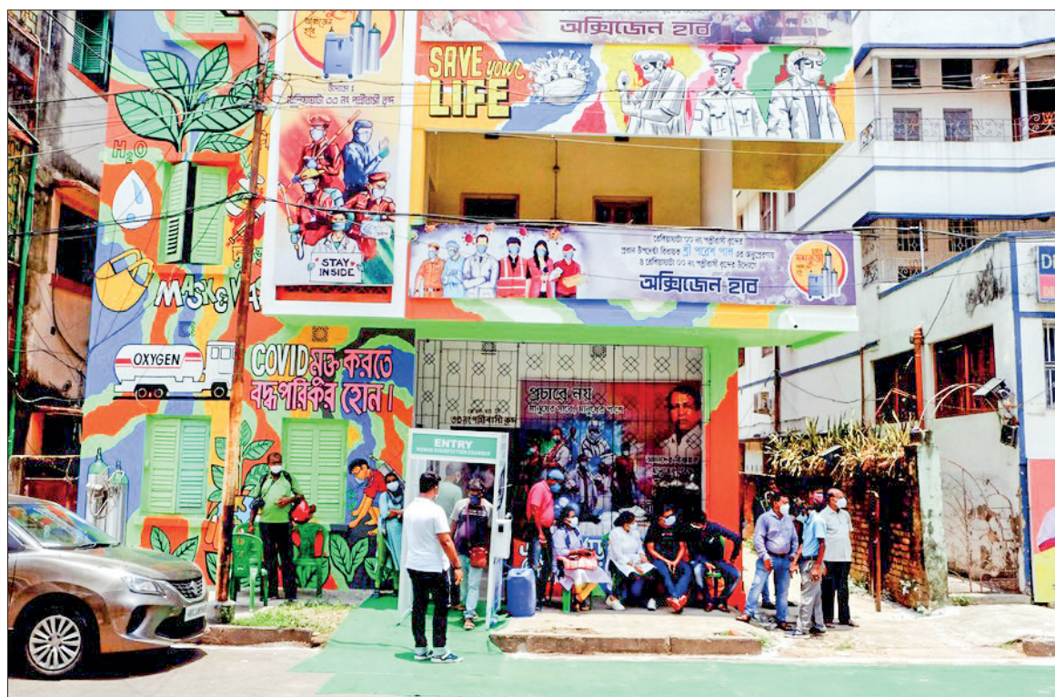
Photo taken on May 23, 2021 shows the graffiti drawn on a building which is converted into a care center with oxygen support for COVID-19 patients in Kolkata, India.

"WHO is committed to working with all countries to strengthen