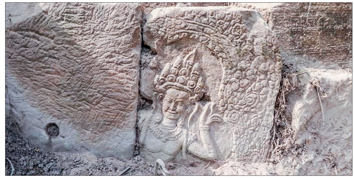
Undated photo shows an Apsara carving found recently at the causeway of the Angkor Thom temple's Takav Gate in the Angkor Archaeological Park in Siem Reap province, Cambodia. Archaeologists have discovered pieces of the 12th century Apsara, or fairy carvings, in the Angkor Archaeological Park in northwest Cambodia's Siem Reap province, the APSARA National Authority (ANA) said in a statement on 2 May 2022.

Angkor Thom is one of the key temples in the 401-square