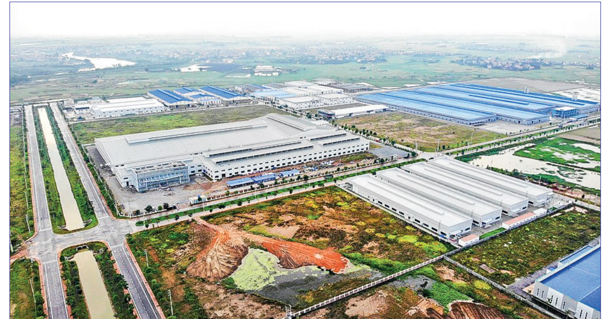
Photo taken on 22 September 2021 shows an industrial area in Bac Giang province, Vietnam.

Association of Foreign Invested Enterprises, has predicted FDI realized capital would rise some 10 per cent this year, while registered capital would increase by 10-15 per cent. The country attracted nearly 31.2 billion US dollars in total foreign investment in 2021, up 9.2 per cent from 2020, with top foreign investors being Singapore, South Korea, Japan