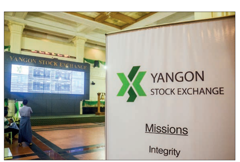
Data indexings are seen at the Yangon bourse.

THE equity market sees a slight increase in trading in April as against that recorded in March 2022, the Yangon Stock Exchange's monthly price data indicated.