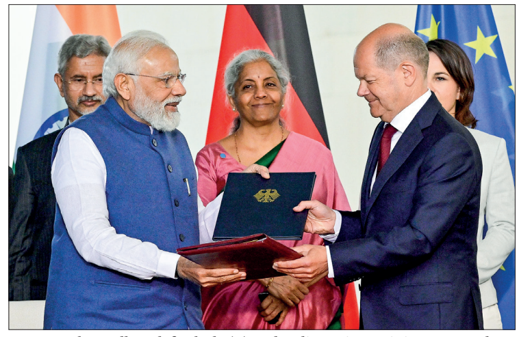
German Chancellor Olaf Scholz (R) and Indian Prime Minister Narendra Modi (L) exchange documents during a signing ceremony at the Indo-German governmental consultations at the Chancellery in Berlin on 2 May 2022.

INDIAN Prime Minister Narendra Modi headed to Europe on Monday with New Delhi's refusal to condemn Russia's invasion of Ukraine set to be a key talking point in meetings with regional leaders.