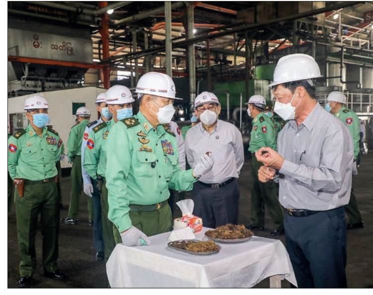
The Vice-Senior General views the measuring of weight of oil palm fruits.

He viewed measuring the weight of oil palm fruits at the South Dagon Crude Palm Oil Factory, inspecting the quality of fruits, steaming the fruits, milling, and producing crude