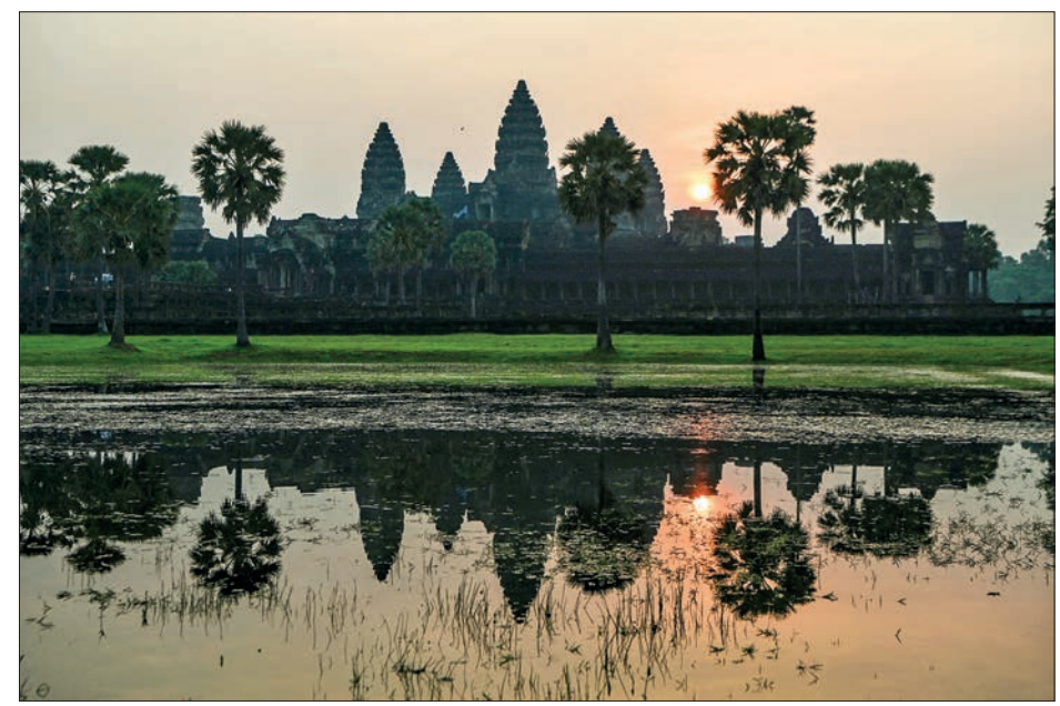
The sun rises over the Angkor Wat temple complex, a UNESCO World Heritage Site, in Siem Reap province on 8 April 2022.

Located in the northwestern Siem Reap province, the 401-square-km Angkor Archaeological Park, inscribed on the World Heritage List of the United Nations Educational, Scientific and