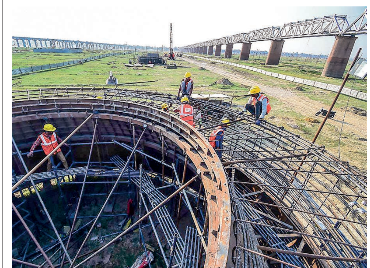
India's government has pledged to spend billions of dollars on public infrastructure to reboot an economy that is bouncing back from the massive contraction it suffered during the novel coronavirus pandemic.

likely to take over 12 years to overcome the for 2012-13 to 2016-17). COVID-19 losses, according to a report released by the Reserve Bank of India (RBI) on 29 April. In its report on 'currency and finance for the year 2021-22', the RBI said, the pandemic is ongoing structural changes catalyzed by the pandemic can beyond that, India is expected potentially alter the growth tra- to overcome COVID-19 lossjectory in the medium-term. es in 2034-35," the report said. "Sustained thrust on capital ex- The output losses for individual penditure by the government, years have been worked out to Rs a no-COVID policy in some jurispush to digitalization and growing opportunities for new investment in areas like e-commerce, startups, renewables and supply chain logistics could in turn, contribute leased the Report on Currency and to step up the trend growth while Finance (RCF) for the year 2021-22 In India, the restriction levels are closing the formal-informal gap on Friday. The theme of the report in the economy," the report noted. The RBI further noted in the rethe context of nurturing a durable evolving situation." port, the pre-COVID trend growth recovery post-COVID and raising rate works out to 6.6 per cent trend growth in the medium-term. (CAGR for 2012-13 to 2019-20) and The blueprint of reforms proposed