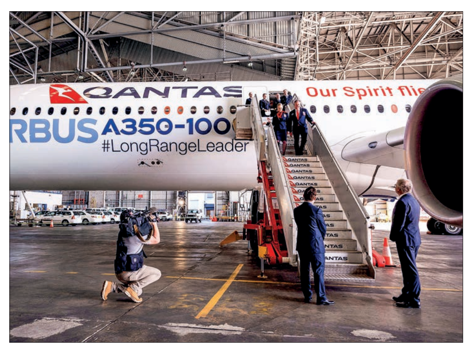
An Airbus A350-1000 aircraft is seen inside a hangar at Sydney international airport on 2 May 2022, to mark a major fleet announcement by Australian airline Qantas. Qantas announced on 2 May it will launch the world's first non-stop commercial flights from Sydney to London and New York by the end of 2025, finally conquering the "tyranny of distance".

research flights for the long-haul route in 2019, including a trial London-Sydney trek of 17,800 kilometres (11,030 miles), which took 19 hours and 19 minutes.