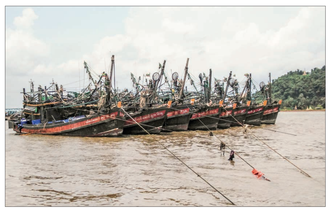
There are over 300 registered large vessels and 500 small vessels for squid fishing in Myeik District, Taninthayi Region. Myanmar's squids are primarily shipped to markets in China and Thailand.

THE squid fishing business flourished during the close season this year because of a good price, squid fishing vessel operators said.