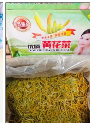
Confiscated illegal goods.

were made (an estimated value of K37,430,478), according to the Anti-Illegal Trade Steering Committee. — MNA