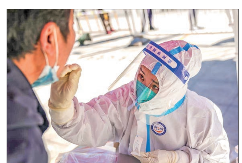
A medical worker takes a swab sample from a resident for nucleic acid testing in Daxing District, Beijing, capital of China, 30 April 2022.

A total of 4,662 COVID-19 patients were discharged from hospitals after recovery on the Chinese mainland on Sunday,