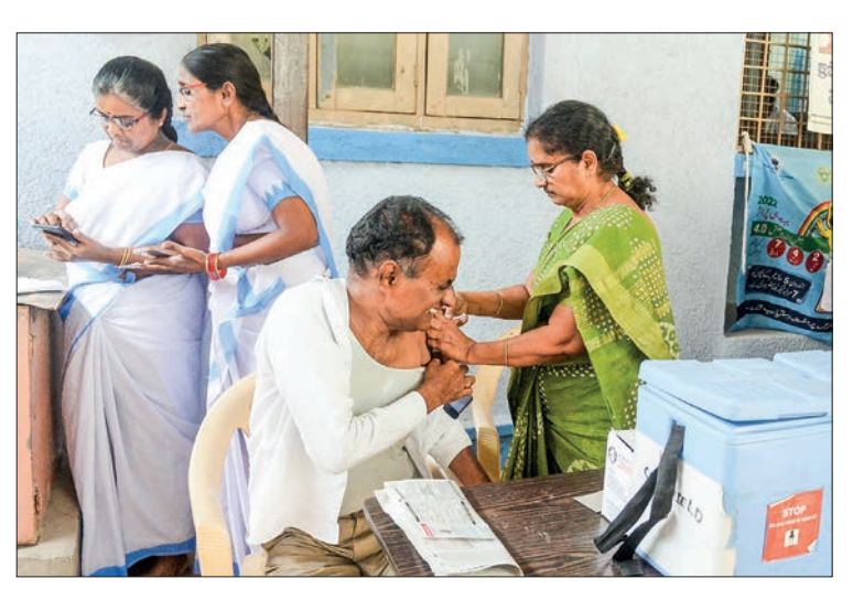
A health worker (R) inoculates a man with a booster dose of the Covishield vaccine against the Covid-19 coronavirus at a vaccination centre in Hyderabad on 22 April 2022.

INDIA'S COVID-19 tally rose to 43,082,345 on Monday as 3,157 new cases were registered during the past 24 hours across the