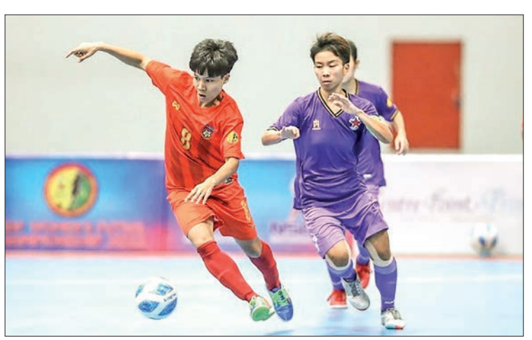
Myanmar futsal team player (red) carries the ball during a match against the Thai All-Stars team in the NSDF Women's Futsal Championship 2022 in Thailand on 23 April.

INDONESIA has withdrawn from the 31st SEA Games Women's Futsal Championship, which will be hosted by Viet Nam, leaving only four teams, including Myanmar, to compete in the tourney.